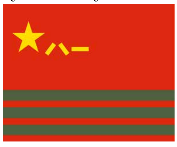
Figure 3. New PAP Flag

Nevertheless, PAP reforms also ensured that all provinces, autonomous regions, and provincial-level cities retain mobile detachments as well as "duty detachments" [ zhiqin zhidui , 执勤支队], which protect government compounds and perform other routine duties. This suggests that party leaders were not confident that local officials would be able to handle "mass incidents" through their own public security resources, even though local police are increasingly well-equipped including carrying firearms—and despite